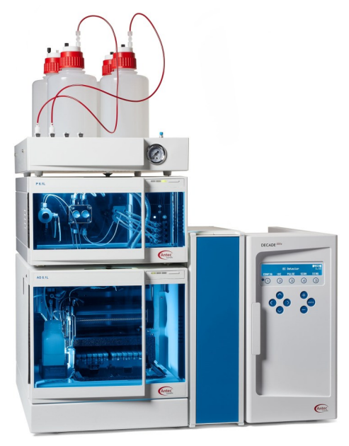
Figure 1: ALEXYS Carbohydrate Analyzer consisting of the ET210 eluent tray (for N_2 blanketing), a P6.1L quaternary LPG pump, AS6.1L autosampler, CT2.1 column thermostat, and the DECADE Elite electrochemical detector.

This application note describes a method for the profiling of oligo— and polysaccharides in honey sample using High-Performance Anion Exchange Chromatography in combination with Pulsed Amperometric Detection (HPAEC-PAD). HPAEC-PAD stands out as the most sensitive technique for the